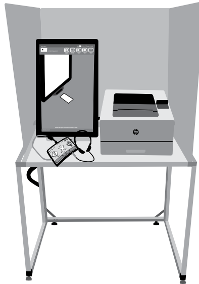
Touchscreen Voting Unit

IMPORTANT: The voter's ballot is not cast until they have inserted it into the ballot scanner.